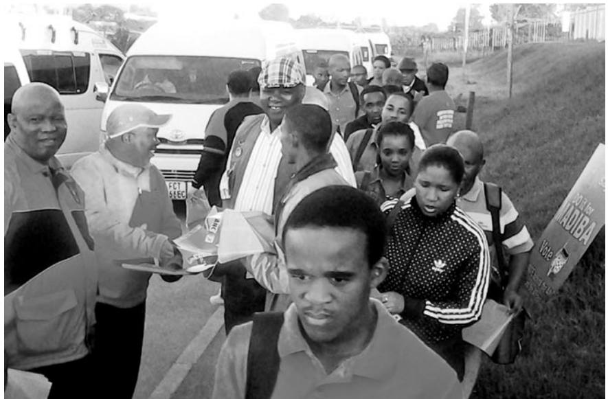
Eastern Cape comrades engaging commuting East London workers

led interventions in other industrial sectors including clothing and textiles, imposing a 75 percent local procurement requirement on the public sector.