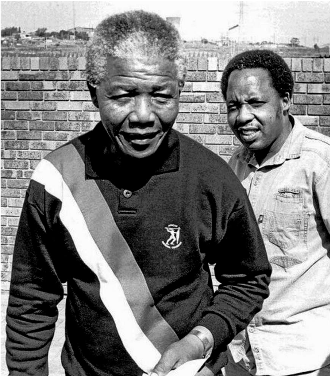
Cdes Nelson Mandela and Chris Hanu – personifying our Alliance’s values