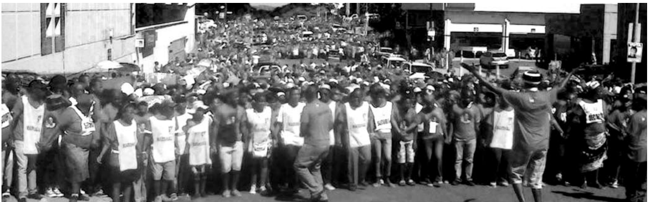
An SACP election march in KZN

Cleaning house in DPW, and building community cohesion in gang-ravaged Mannenberg with Cde cronin