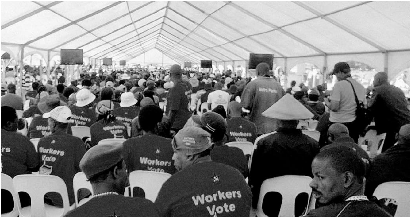
Doing it for Cde Chris: Comrades at the 21st anniversary commemoration of the death of Chris Hani at the Thomas Nkobi Memorial Cemetery, Boksburg, on 10 April 2014