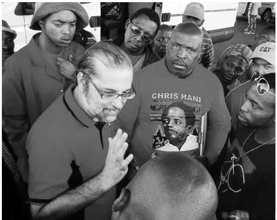
Politburo member Cde Yunus Carrim engaging commuters at a Welkom taxi rank

● Why is it that the ANC expects SACP members to work so hard, but when it comes to elections to legislatures and municipalities and deploying comrades to positions, SACP members are so often