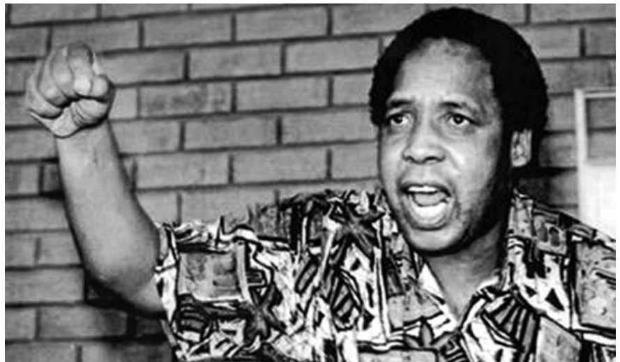
Chris Hani: In his memory, workers must unite and vote ANC