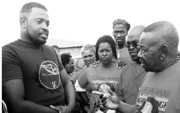
General Secretary Cde Blade Nzimande engages residents while campaigning door-to-door at Paardekraal in the North West