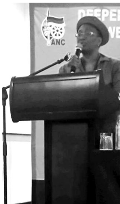
National Treasurer Cde Joyce Moloi-Moropa (centre) with General Secretary Cde Blade Nzimande, and 2nd Deputy General Secretary Cde Solly Mapaila, and (left) addressing an election meeting

were running the shops and responsible for most of the trading in the township and this was causing tensions.